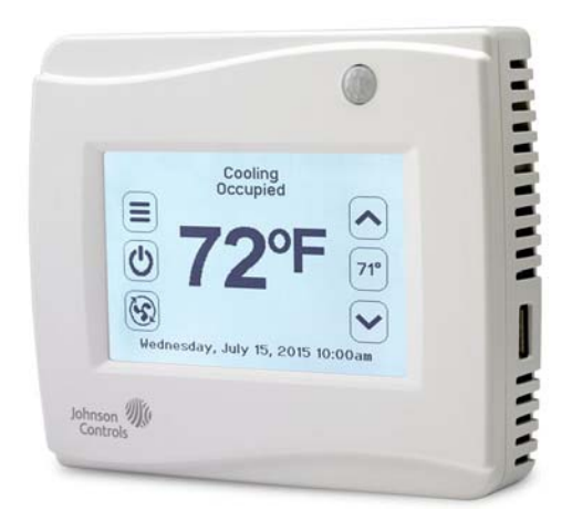
Figure 1: TEC3000 Series Thermostat Controller Shown with Occupancy Sensor

All models feature an intuitive UI with backlit display that makes setup and operation quick and easy. Multiple fan configurations are supported for fan coil equipment types: